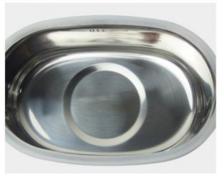
SUS304 tank, corrosion-resistant, heat-resistant, safe and duarable