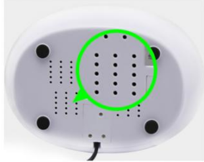
With cooling holes