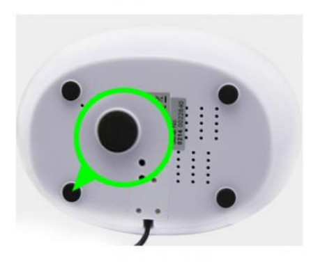
With silicone feet, non-slip and solid