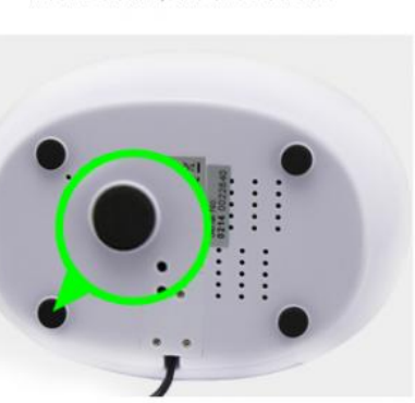
With silicone feet, non-slip and solid