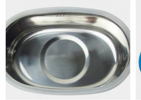
SUS304 tank, corrosion-resistant, heat-resistant, safe and duarable