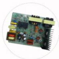
upgrade driver board