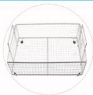
sus basket (optional)