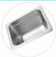
tank size :500 x300x200