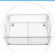
sus basket (optional)