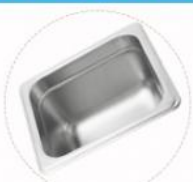
tank size :330 x300x150