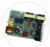
upgrade driver board