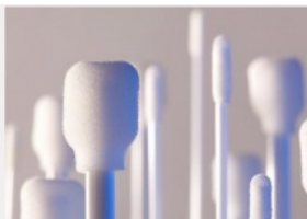
Life Sciences & Medical