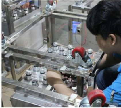
② product assembling