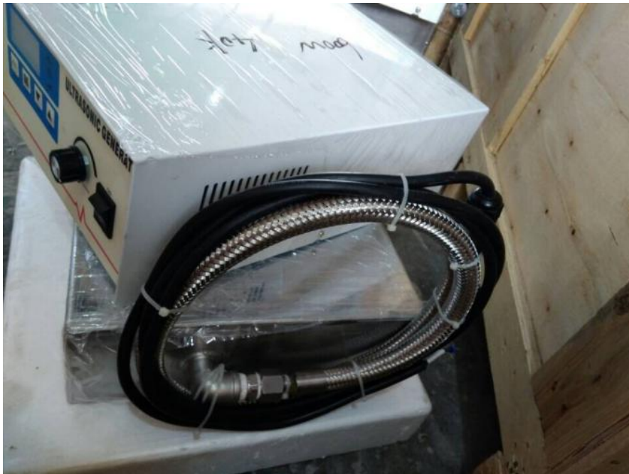
The ultrasonic generator