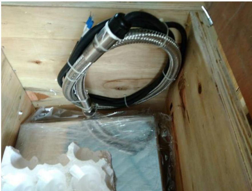
Package: wooden case