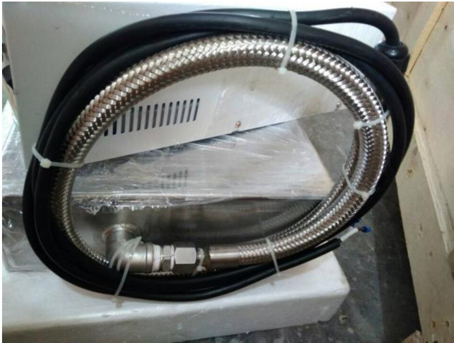
The lead-out way: ISM