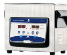
PRODUCT PHOTO 1 Angle of 45-degrees display Circuitry/Hardware parts/Circuit Board/Laboratory/Chemistry