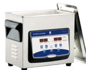
2 Multi-directional Circuitry/Hardware parts/Circuit Board/Laboratory/Chemistry