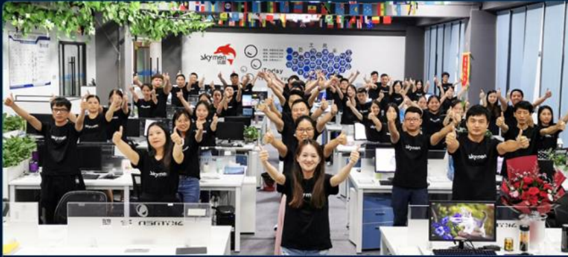
Sales team 80+