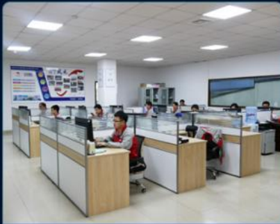
R&D team 20+