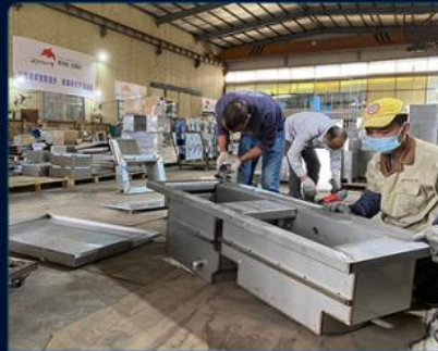
Factory employees, 500+