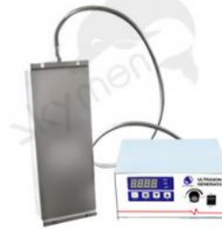
Outlet mode-hose diagram