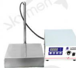
Outlet method-hard tube diagram