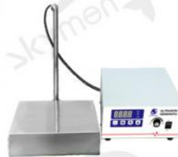
Outlet method-hard tube diagram