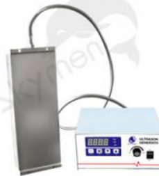
Outlet mode-hose diagram