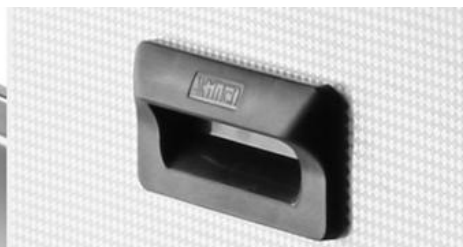
❸ Insulation handle design