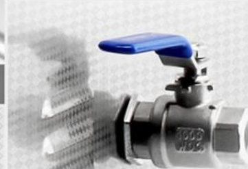
❹ Stainless steel drain valve