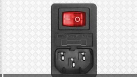
❺ Ground plug and power switch