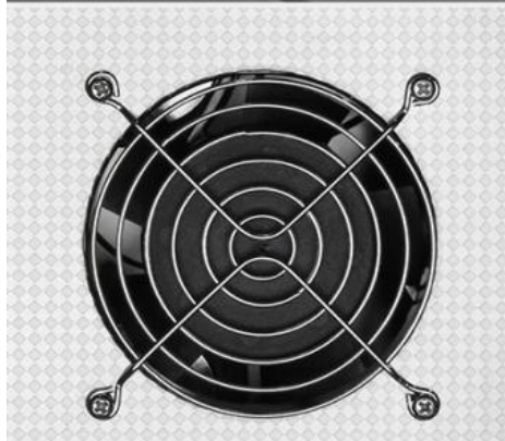
❷ Cooling system