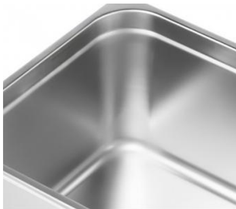
❶ SUS 304 tank