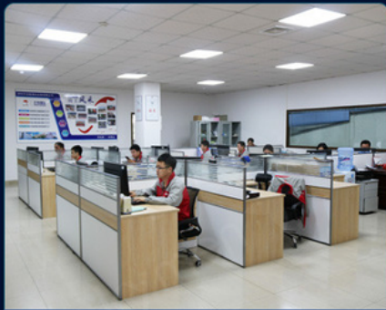
R & D team