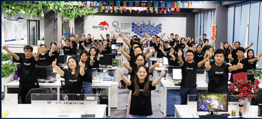
Sales team of more than 80 people