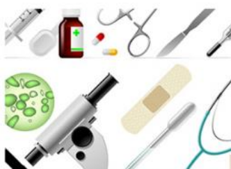
Dental Hospital Instrument