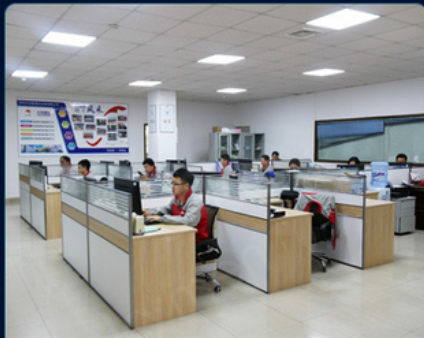
R & D team