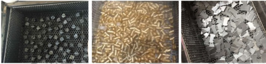
Copper, aluminum, stainless steel, hardware industry applications