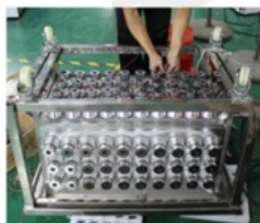
4 Transducer Installation