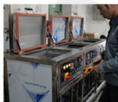
8 Age Testing