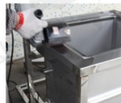
6 Tank Polishing