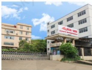
Skymen Shaoguan Production Base

Professional Ultrasonic Cleaner Manufacturer