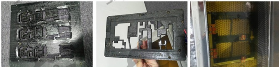
Fixture industry application