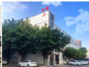
Skymen Shajing R&D Center