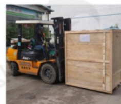
9 Skymen Factory Shipping