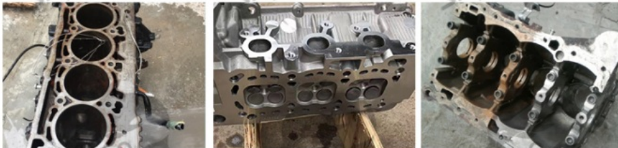
Auto parts, aviation, shipbuilding, industry applications