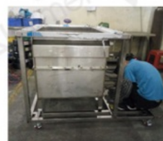
3 Tank Welding