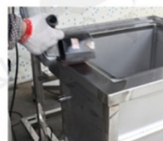
6 Tank Polishing