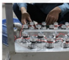
5 Skymen Transducer Wiring