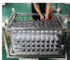
4 Transducer Installation