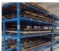
1 Raw Material