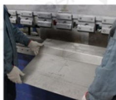
2 Board Cutting