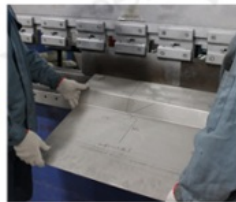
② Board Cutting