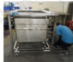
③ Tank Welding