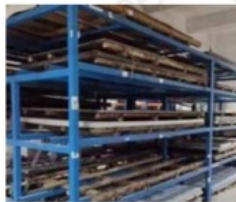
① Raw Material