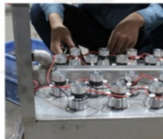
⑤ Skymen Transducer Wiring