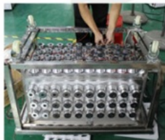
④ Transducer Installation