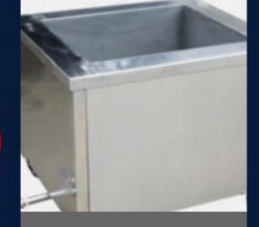
Other brand cleaning machine flat cylinder mouth, water is easy to splash out