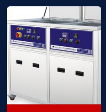
Skymen Brand Ultrasonic Cleaner Button Panel, Concise and Saving Effort