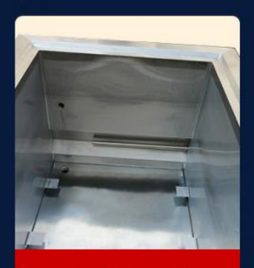
Skymen Brand Concave cylinder Mouth design, No Overflowing Water good noise elimination