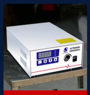
Skymen brand using self-developed ultrasonic generator, digital automatic frequency scanning stable output