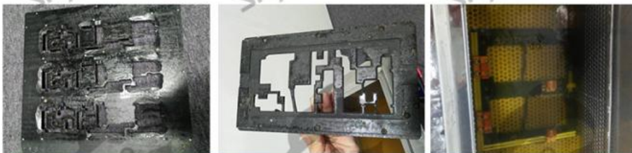
Fixture industry application