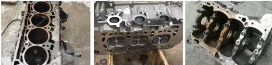
Auto parts, aviation, shipbuilding, industry applications