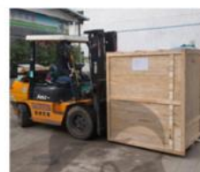
9 Skymen Factory Shipping