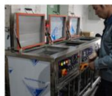
8 Age Testing