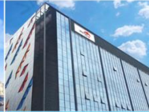
Skymen Fuyong Marketing Center