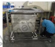
3 Tank Welding