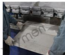
2 Board Cutting