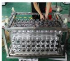
4 Transducer Installation