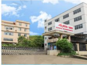
Skymen Shaoguan Production Base

Professional Ultrasonic Cleaner Manufacturer