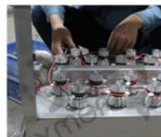
5 Skymen Transducer Wiring