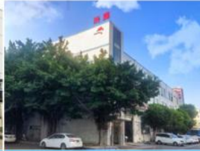
Skymen Shajing R&D Center