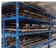
1 Raw Material