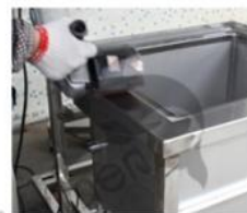
6 Tank Polishing