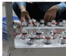
5 Skymen Transducer Wiring