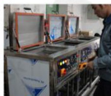
8 Age Testing