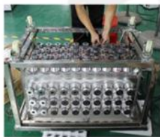
4 Transducer Installation