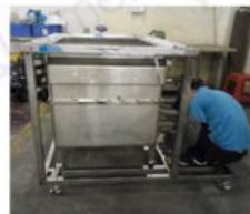
3 Tank Welding