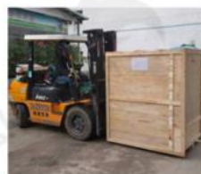
9 Skymen Factory Shipping