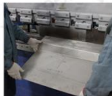
2 Board Cutting