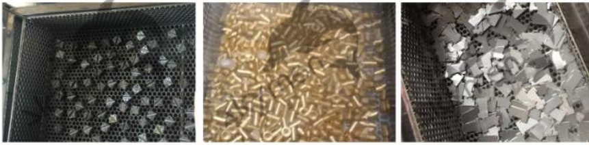
Copper, aluminum, stainless steel, hardware industry applications