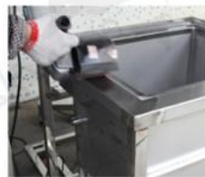
6 Tank Polishing