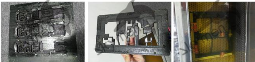
Fixture industry application