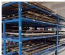
1 Raw Material