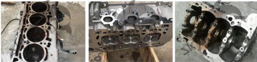
Auto parts, aviation, shipbuilding, industry applications