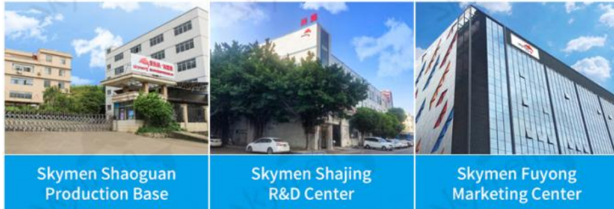
Skymen Shaoguan Production Base

Professional Ultrasonic Cleaner Manufacturer