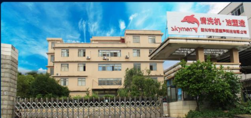
Production Base in WuJiang ,Shao Guan City ,Guang Dong Province