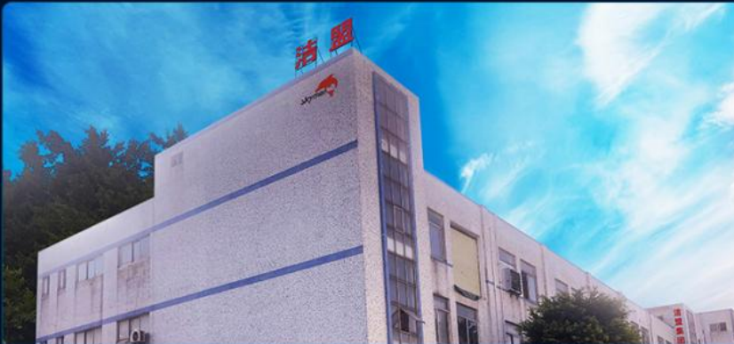
R&D Center in Sha jing,Shenzhen City,Guang Dong Province