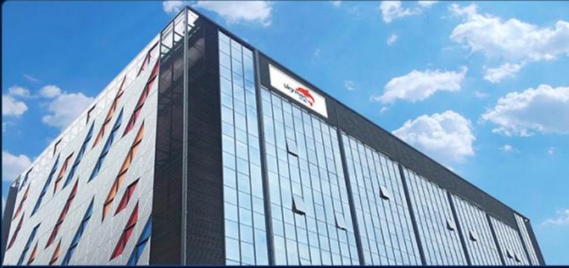
Sales Center in Fuyong ,ShenZhen City ,GuangDong Province