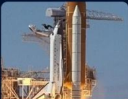
Aeronautics And Astronautics