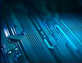
The Electronics Industry