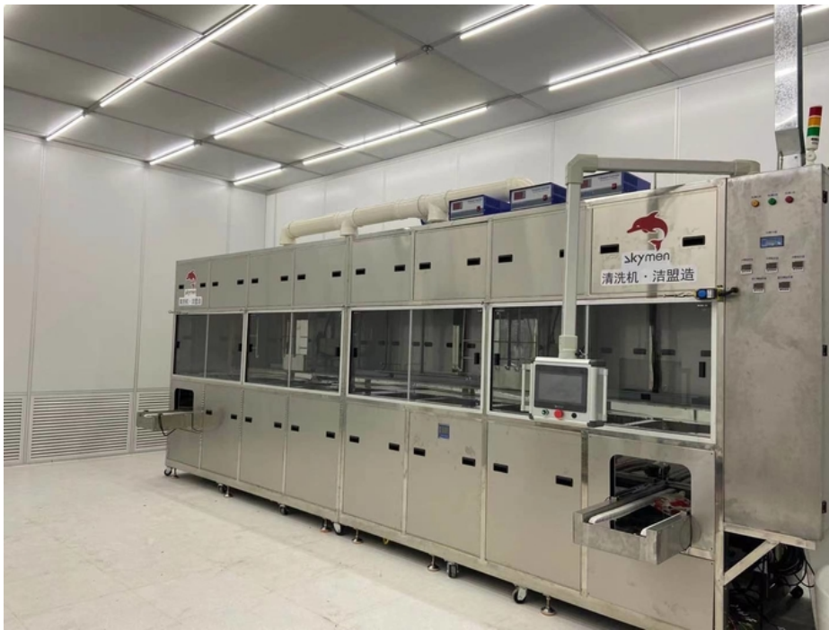
Ultrasonic Cleaner's Cleaning Effect: