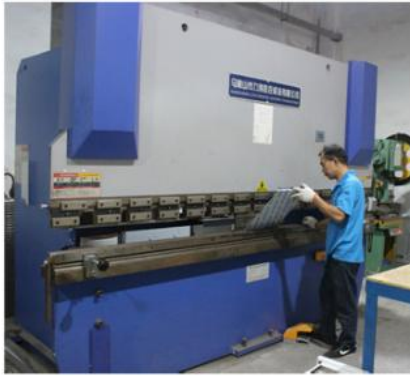
① material processing