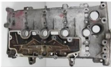
How to clean?