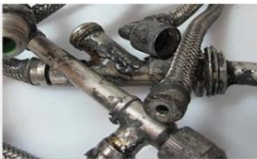
How to clean?