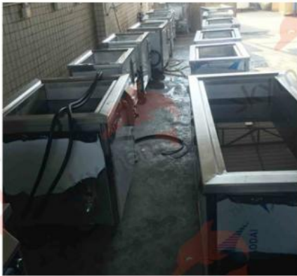
③ product test