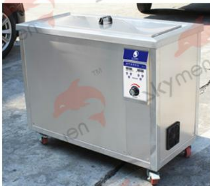
④ finished product