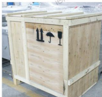
⑥ wooden case