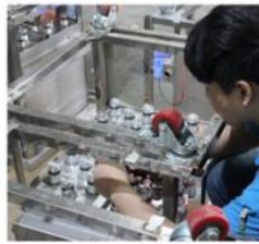
2 Product assembling