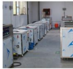
3 Product test