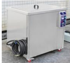
4 Finished product