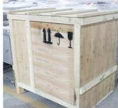
5 Product packaging