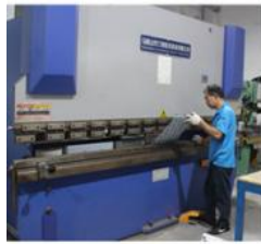
1 Material processing