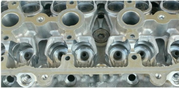
Case study 2