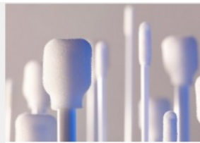
Life Sciences & Medical