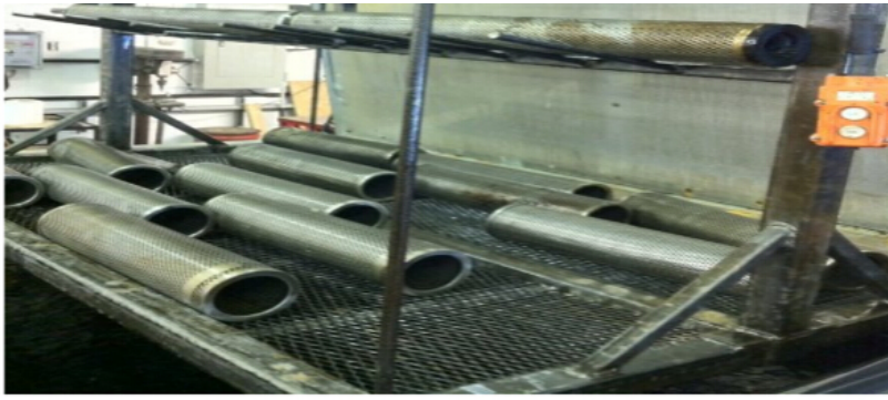
Oil Filters for cleaning