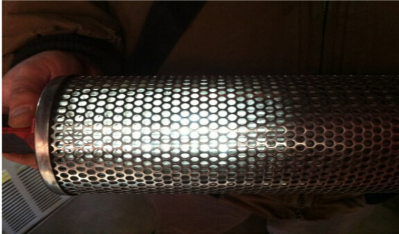
Cleaned oil filters with Light passing through