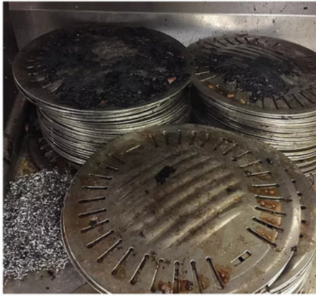
Korean BBQ Grill Plate Cleaner