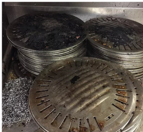
Korean BBQ Grill Plate Cleaner