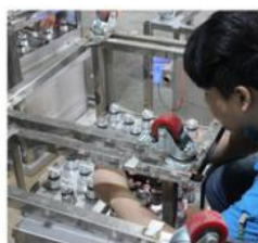
2 Product assembling