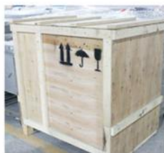
5 Product packaging