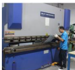
1 Material processing