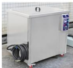
4 Finished product