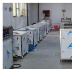
3 Product test