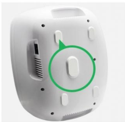
With silicone feet, non-slip and solid