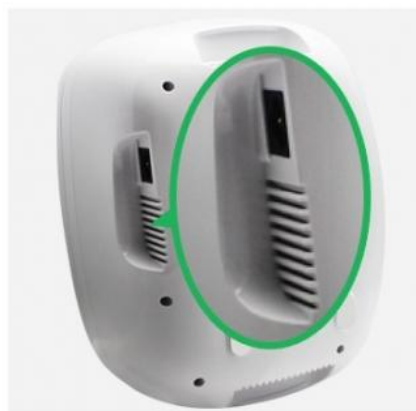
With cooling holes