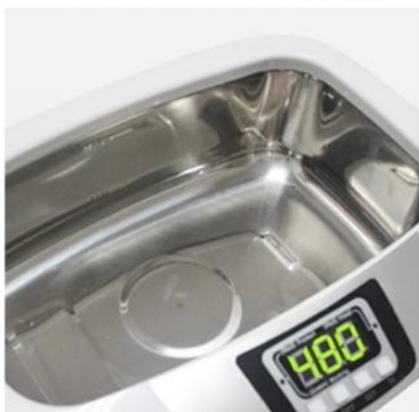
SUS304 tank, corrosion-resistant, heat-resistant, safe and durable