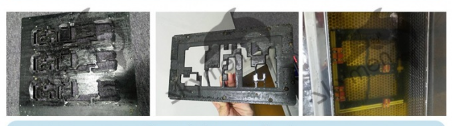
Fixture industry application

Auto parts, aviation, shipbuilding, industry applications