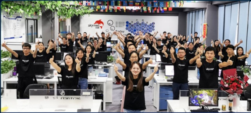
Sales team 80+