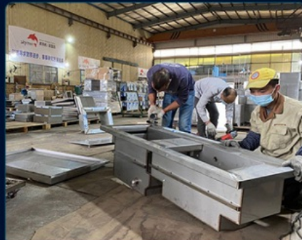
Factory employees, 500+