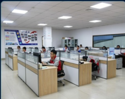
R&D team 20+