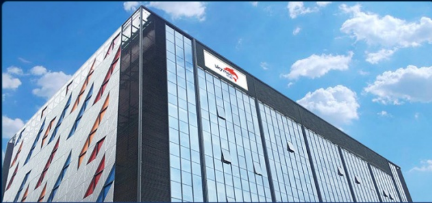
Sales Center in Fuyong ,ShenZhen City ,GuangDong Province