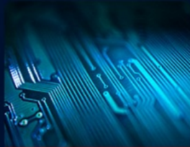
The Electronics Industry