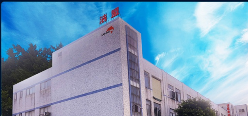
R&D Center in Sha jing,Shenzhen City,Guang Dong Province