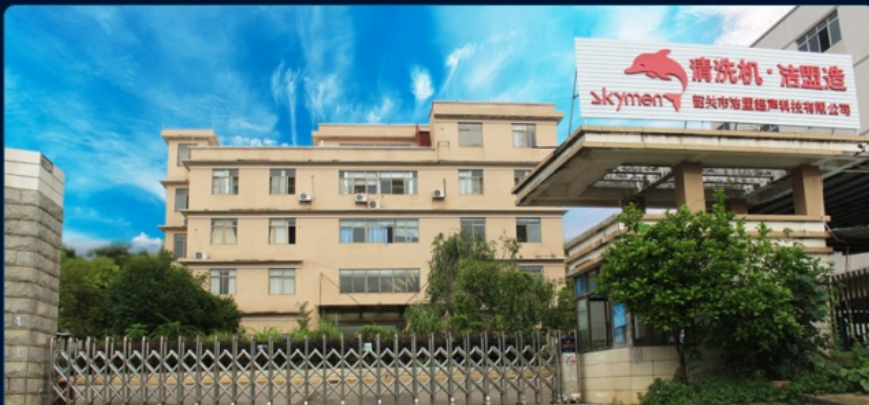
Production Base in WuJiang ,Shao Guan City ,Guang Dong Province