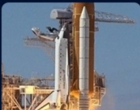
Aeronautics And Astronautics