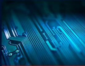
The Electronics Industry