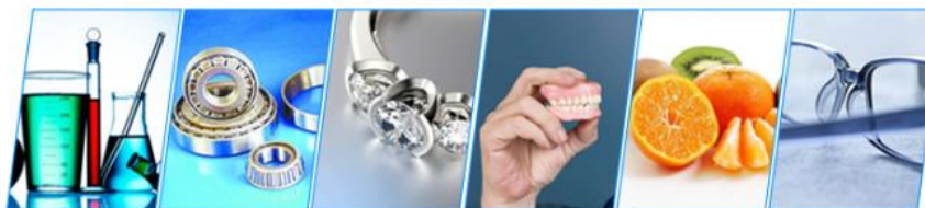
Lab ware Hardware Jewellery Denture Fruit Glasses