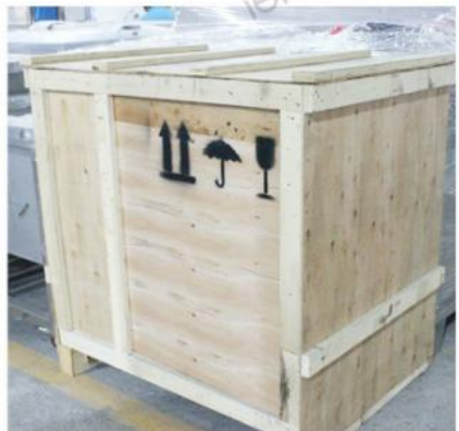
6 wooden case