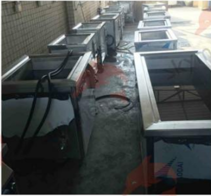
3 product test