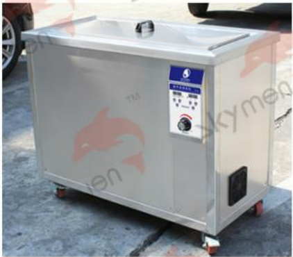
4 finished product