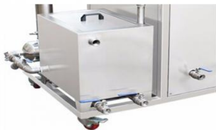
Oil catch can.