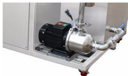
Pressure Pump CE rated CNP pum