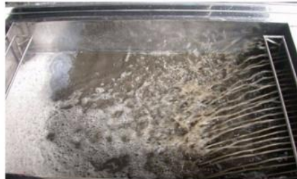
Recycle System. Recycle and store detergent to save cost.

Filter element inside, can be replaced with new one