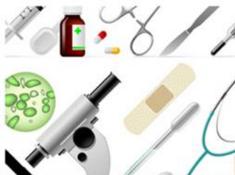
Dental Hospital Instrument