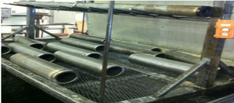
Oil Filters for cleaning