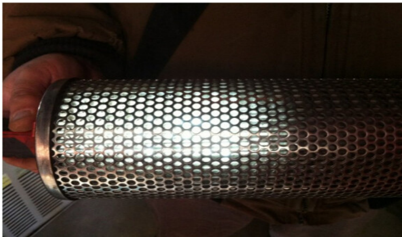
Cleaned oil filters with Light passing through