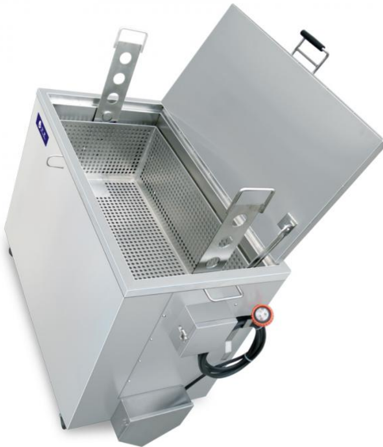
Cake Pan Cleaner