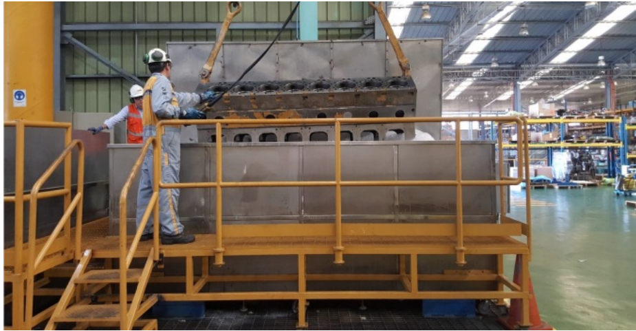
Before and after of engine cleaned: