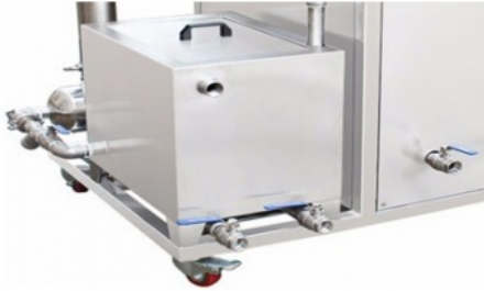
Oil catch can.