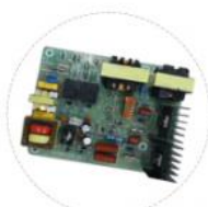
upgrade driver board