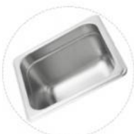
tank size :150 x85x63