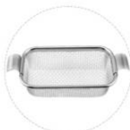
sus basket (optional)