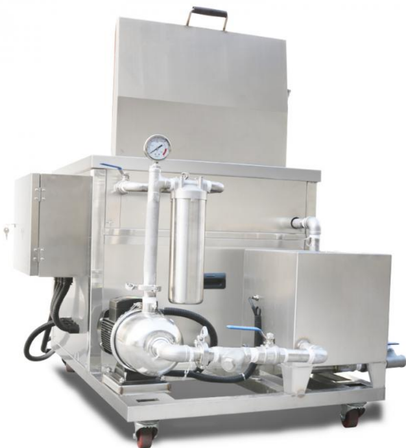
Before and after of use ultrasonic cleaner: