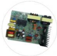
upgrade driver board