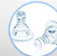
The rubber nipple