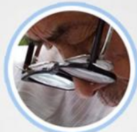
glasses for presbyopia