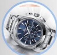
Aluminum alloy watch