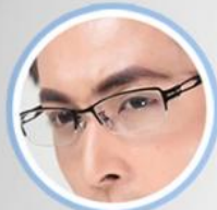
glasses for the myopia