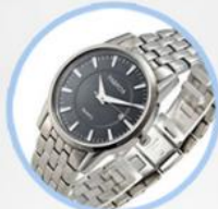
Stainless steel watch