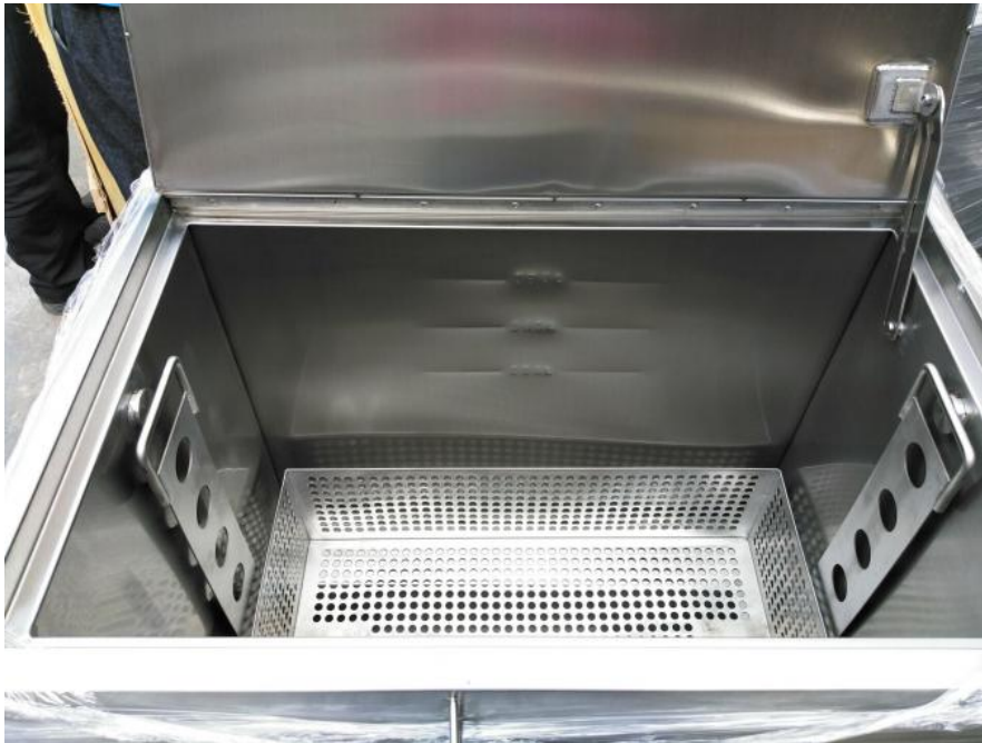
Before and after of using the soak tank: