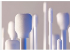
Life Sciences & Medical